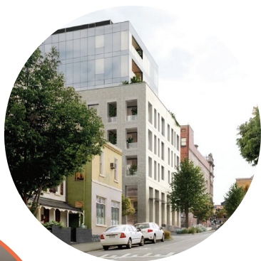
Residential Parcel Locker at Otter Place Collingwood, VIC

Delivering Secure, Efficient, and Scalable Locker Installations to Enhance Operational Flow and Customer Experience